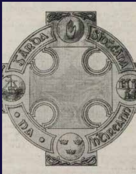
Original design of the Scott Medal rear, Iris an Garda, 1923