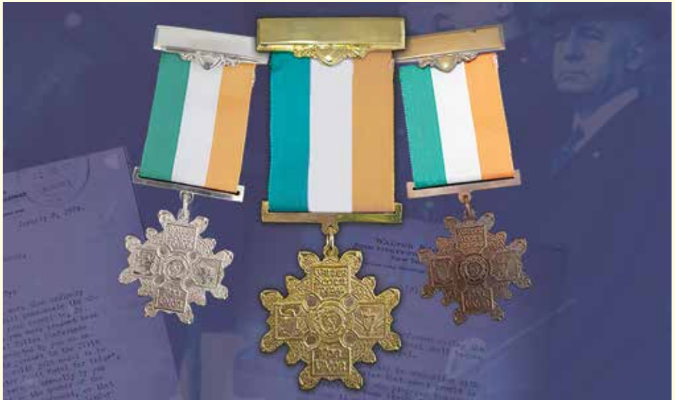
Gold, Silver and Bronze Scott Medals

The medal is in the form of a Celtic cross. There are five panels on the face of the medal that depict the words “The Scott Medal”, “For Valor”, the eagle and the shield of the USA, the harp and sunburst and the Garda Crest. The reverse of the medal carries the inscription, “Garda Síochána na h-Éireann”. The 4 outside panels are the arms of the four provinces of Ireland - Ulster, Munster, Leinster and Connaught.