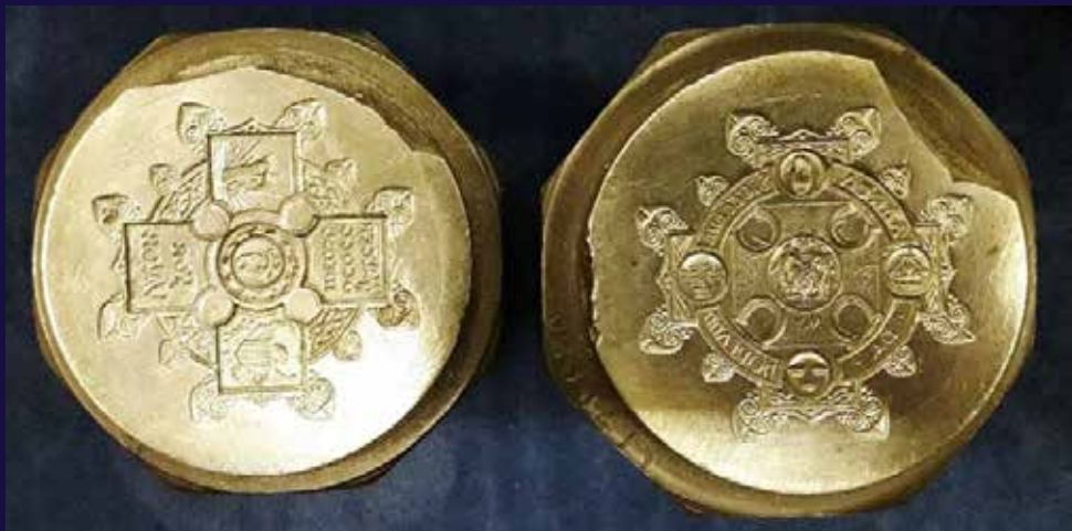
Original dies for the Scott Medal made by Dieges & Clust, New York 1924.