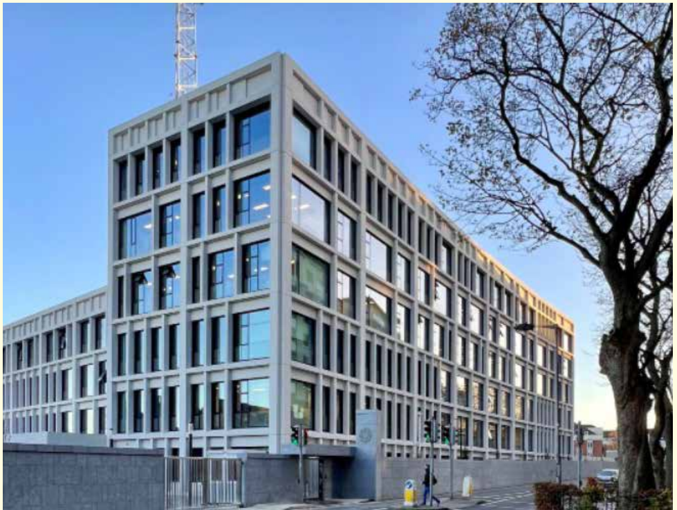
Walter Scott House, Military Road, Dublin 8.

The largest number of awards was between 1971 and 1980, the worst decade for political violence, when 96 medals were awarded, followed closely by the period 1981 to 1990 when 88 medals were awarded. This period of heightened subversion contrasted sharply with the period 1951 to 1960 when medals were awarded to only six members of An Garda Síochána. To date, over 400 medals have been awarded to members of An Garda Síochána.